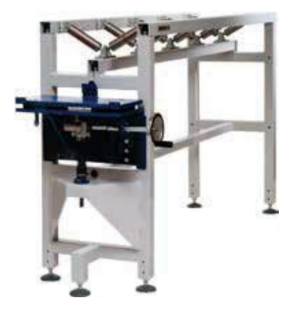
Pipe feeder basic unit