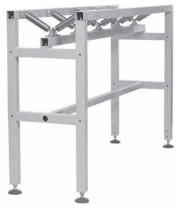
Pipe feeder extension unit