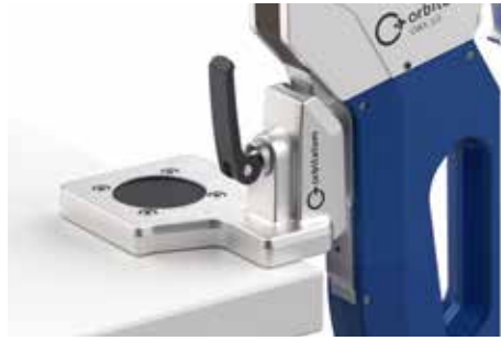
Sturdy aluminum table mount for fastening to the edge or surface of the table.