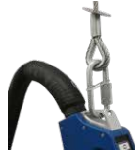
Universal central mechanical fixing interface for drop protection