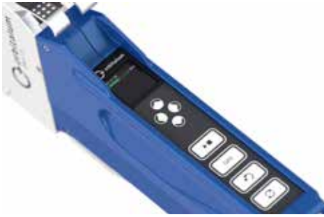
Control unit with display integrated in the aluminum handle.