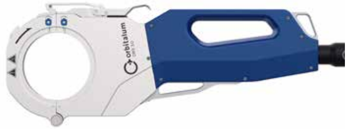
ORBIWELD X 3.0