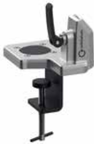
Table mount OWX