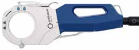
ORBIWELD X 3.0

Clamping inserts are not included in the scope of delivery.